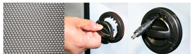
Super Fine Mesh