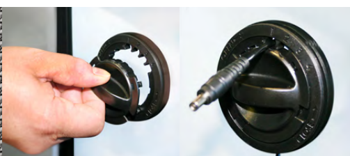
Cable Outlet Dial